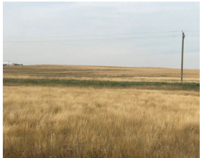
View from property